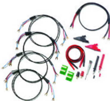
8508A-LEAD kit contents

The 8508A-LEAD set includes high quality, low leakage, low dielectric absorption PTFE insulated cables, terminated with 6 mm gold plated copper spade terminals. Their insulation properties make them ideal for resistance and current measurements minimizing leakage current and charge storage problems, their low capacitance makes them ideal for ac applications, and the 6 mm gold plated copper spade terminals ensure low thermal emfs for dc voltage and resistance work.