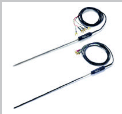
8508A-SPRT and 8508A-PRT

designed and manufactured by the Hart Scientific primary standards metrologists to complement the Fluke 8508A Reference Multimeter's precision PRT temperature function.