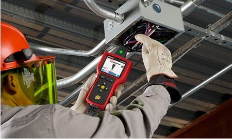
Trace energized or de-energized wires by removing the junction box cover.