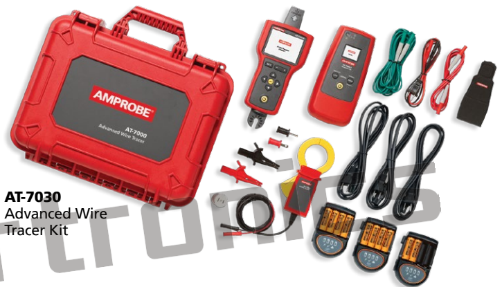
AT-7030 Advanced Wire Tracer Kit