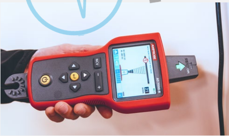
Non-contact voltage (NCV) detection.