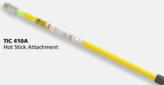
TIC 410A Hot Stick Attachment

The optional TIC 410A Hot Stick accessory enables easier tracing of wires in high ceilings, walls and along floors.