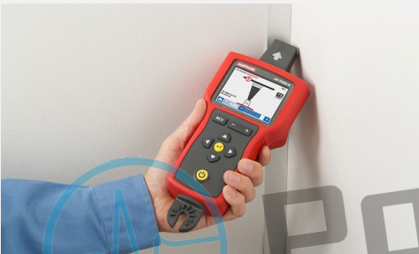
Use the Tip Sensor to trace wires in hard to reach areas.