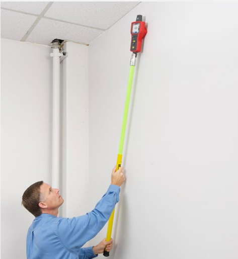
Trace wires in hard to reach places with the TIC 410A.