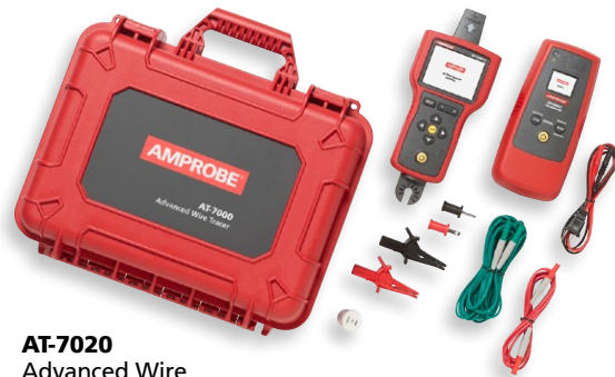
AT-7020 Advanced Wire Tracer Kit