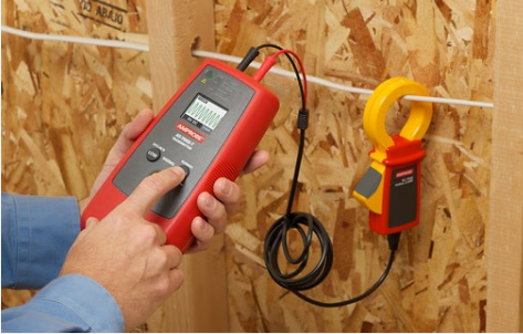
Induce signal with the signal clamp when there is no bare conductor.